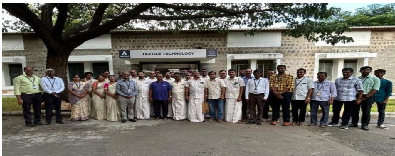
The Silver Jubilee Celebrations of the 1995-1999 batch of Textile Technology, Kumaraguru College of Technology (KCT) were held on July 27, 2024. The event saw the participation of 26 alumni out of the total class strength of 36, marking a significant turnout for this milestone occasion.