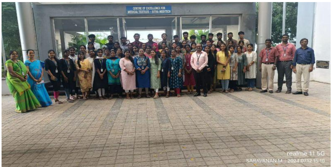
Six-Day Entrepreneur Development Training Programme in Medical Textiles Date: July 6-12, 2024 at South India Textile Research Association (SITRA), Coimbatore