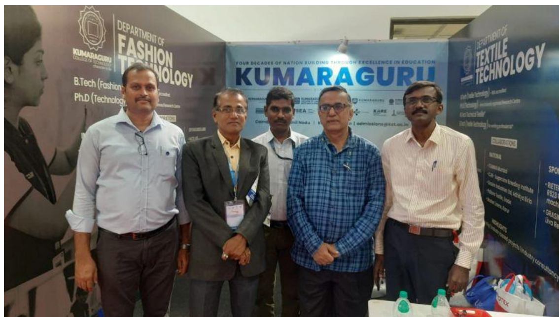
Kumaraguru College of Technology's Textile Cluster participated in the "SIMA TEXFAIR 2024," the largest expo for textile machinery, accessories, and spares, held from June 21-24, 2024, at the CODISSIA Trade Fair Complex, Avinashi Road, Coimbatore.