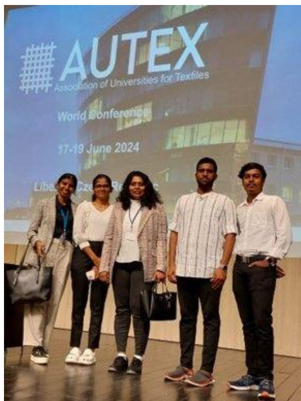
International Summer Internship Program from 29th May to 31st July 2024 at Technical University of Liberec, Czech Republic