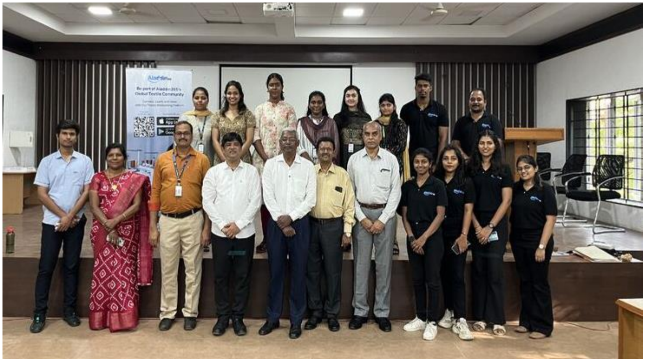
The TexNet365- showcasing the fruitful collaboration between Aladdin365 and the esteemed institution. Through thought-provoking extempore sessions and an interactive quiz competition, students engaged deeply with industry-relevant topics, demonstrating their passion and knowledge in the textile sector.