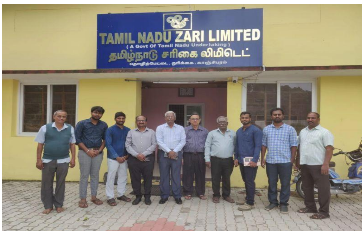
Visit to Tamil Nadu Zari Limited by Kumaraguru College of Technology on 28-11-2024