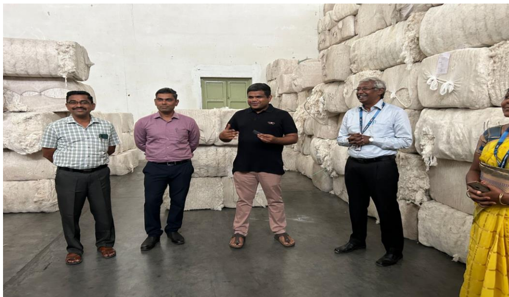
Industrial Visit to Poomex Spinning Koduvai on 12/09/2024