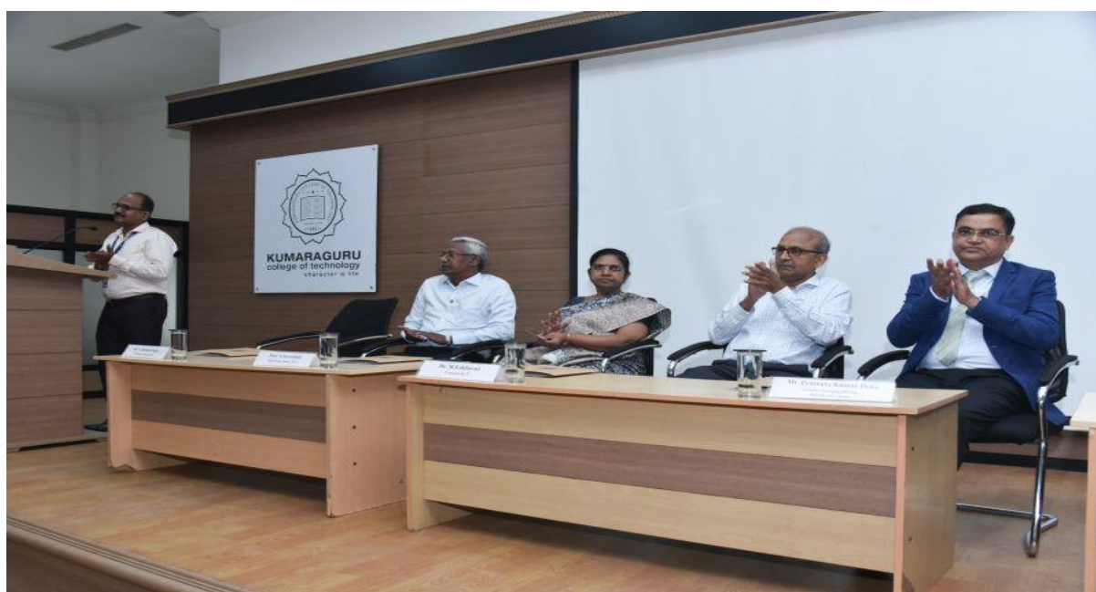
Handover Ceremony of the Rieter R923 Rotor Spinning Machine The Department of Textile Technology at Kumaraguru College of Technology organized a handover ceremony for the Rieter R923 Rotor Spinning Machine on July 22, 2024