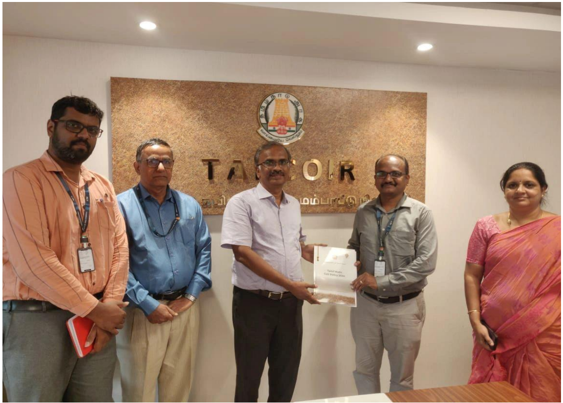
Visit to TANCOIR on 5.10.2024