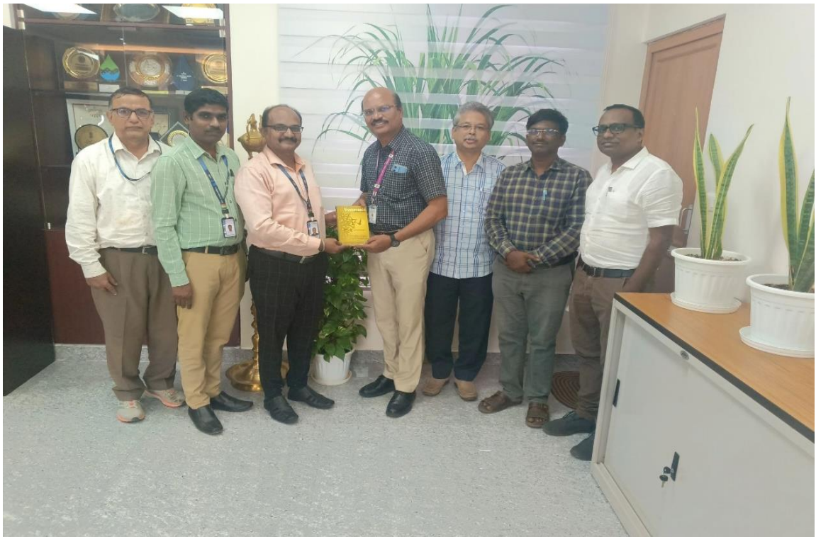
Visit to ICAR-Sugarcane Breeding Institute, Coimbatore on 07.10.24