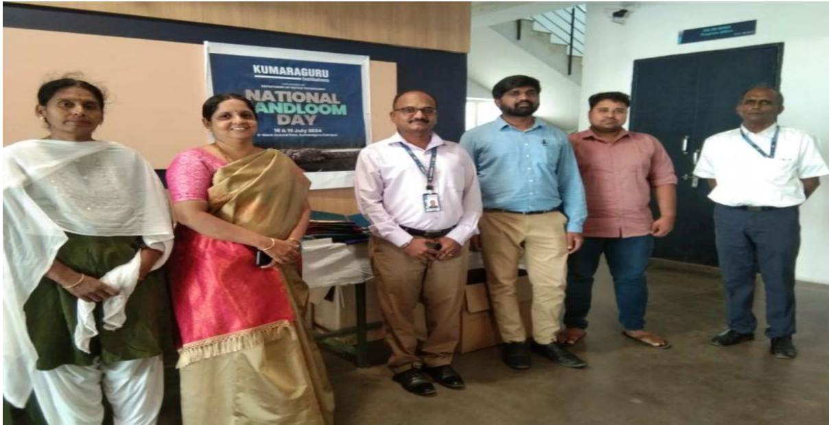
National Handloom Day 2024 Exhibition Cum Sale at Kumaraguru College of Technology On the occasion of National Handloom Day 2024, the Department of Textile Technology at Kumaraguru College of Technology hosted an Exhibition cum Sale featuring the Sri Sirumugaipudur Cooperative Weavers Society from Srimugai.