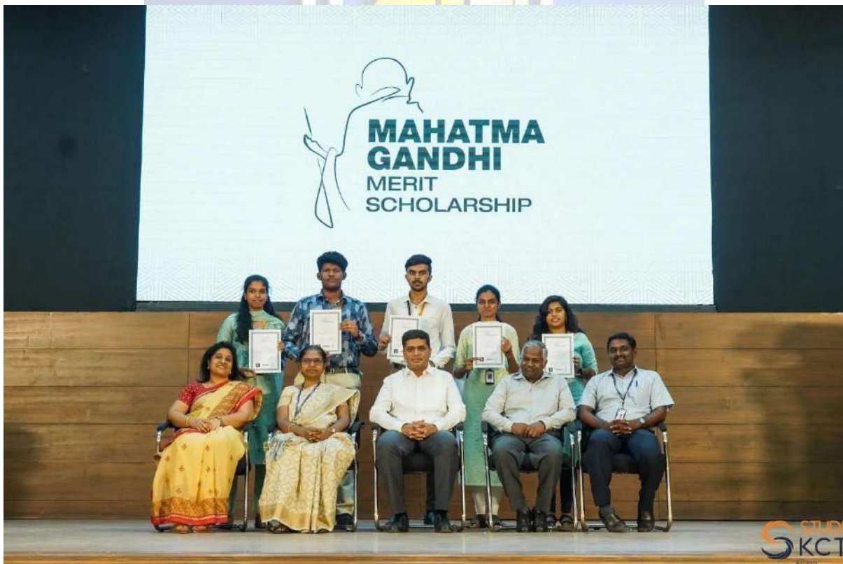
Figure 4 2021- 2025 Batch Awardees