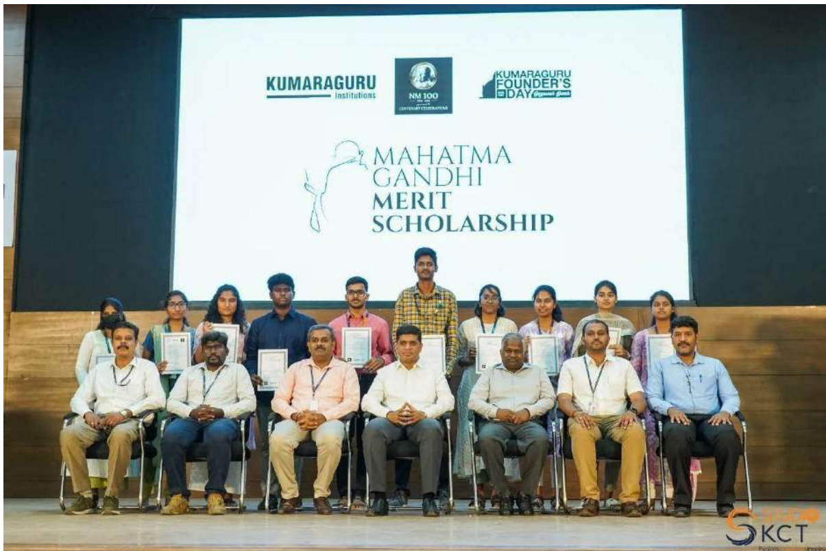
Figure 3 2020-2024 Batch MG awardees