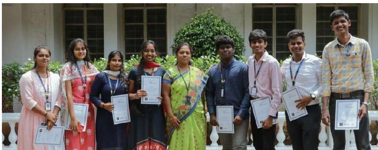
BATCH'24 Students with MG-AWARD