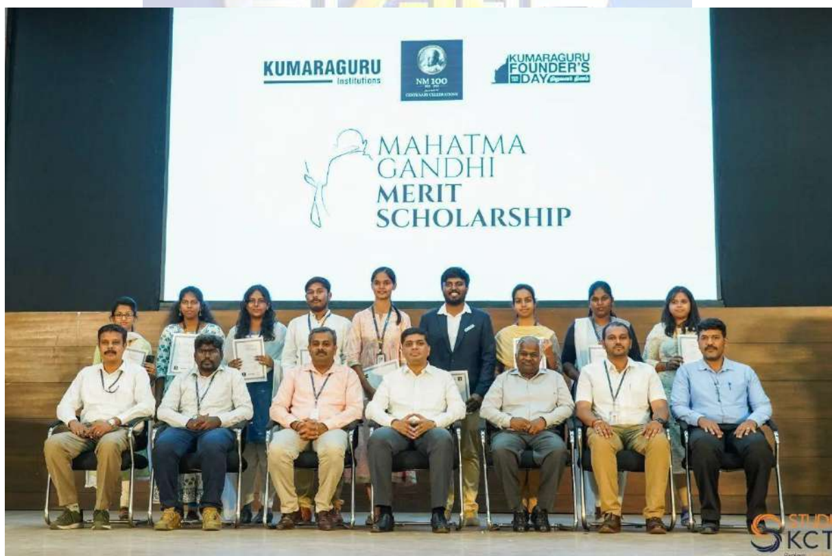
Figure 2 2019-2023 Batch MG awardees