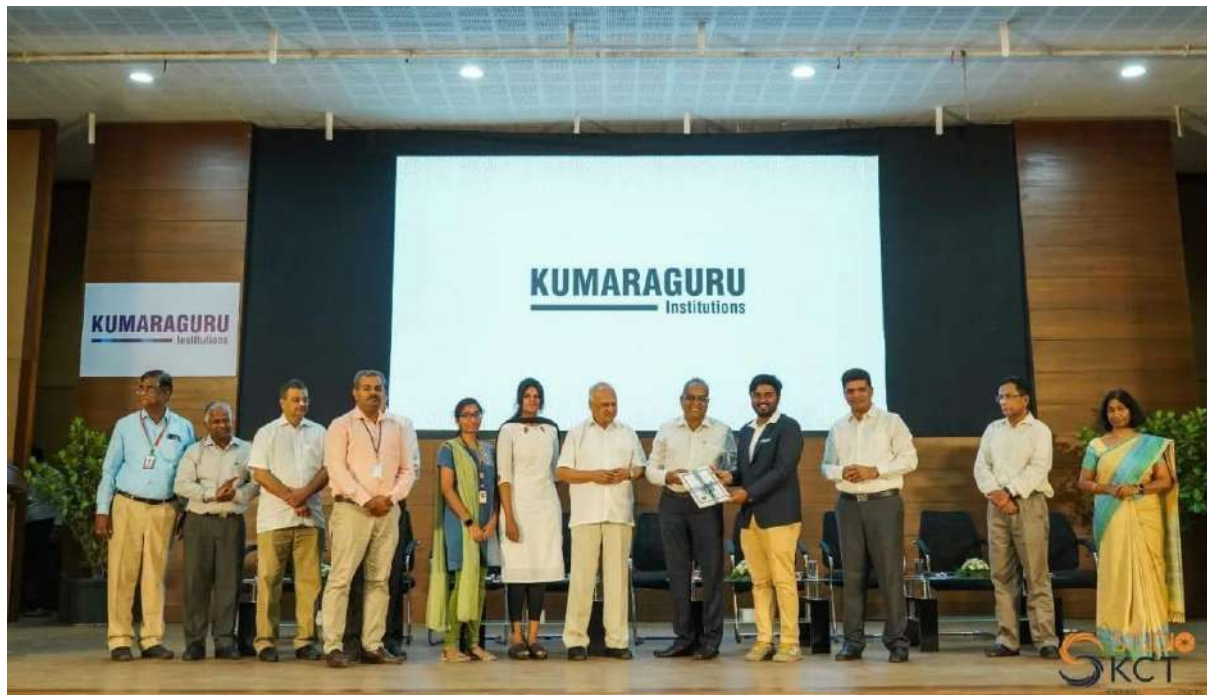
Figure 1. EIE students lead front of the team