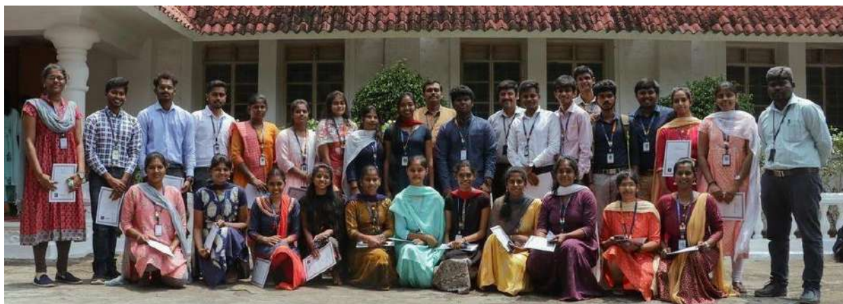
EIE Students with MG-AWARD