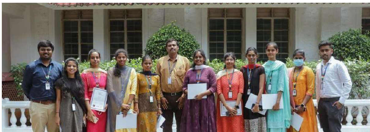
BATCH'23 Students with MG- AWARD