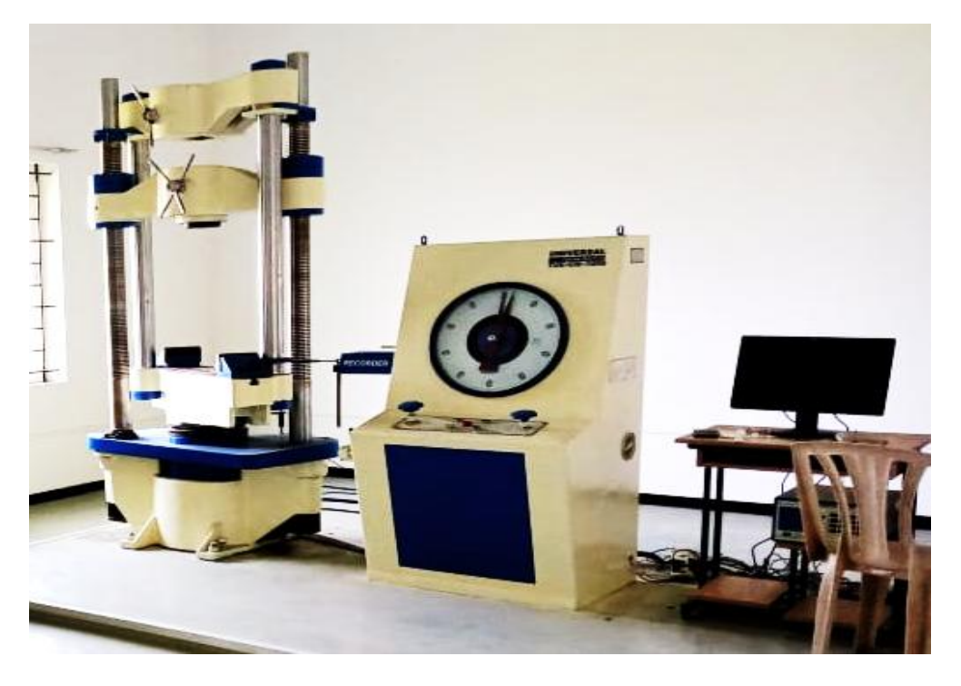
Computerized Universal Testing Machine (1000 kN)