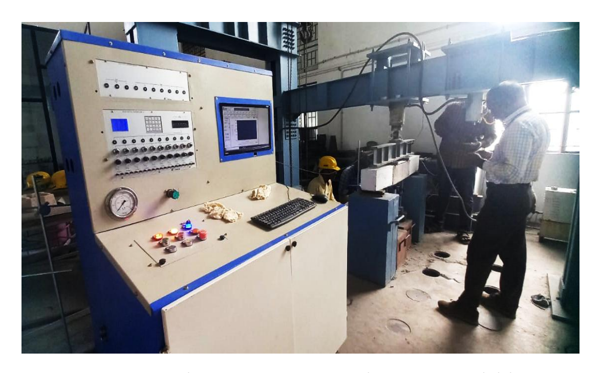
RC beam test in 100 T load frame with Data acquisition