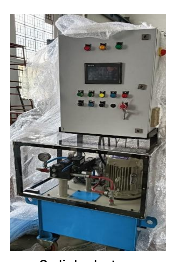
Cyclic load set up