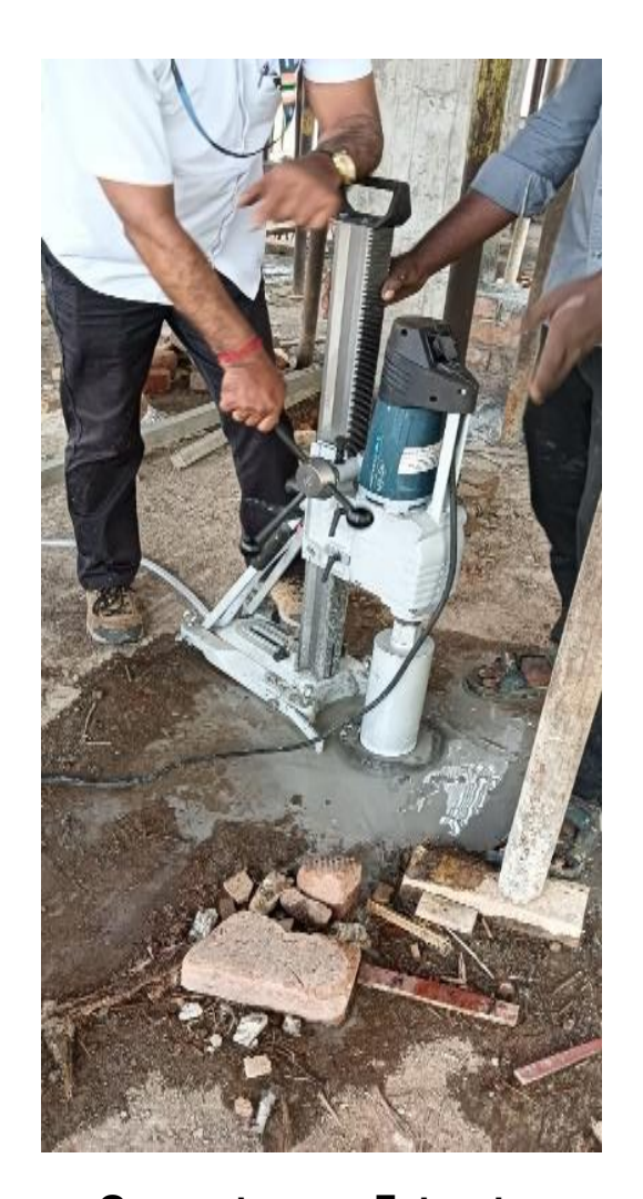
Concrete core Extractor